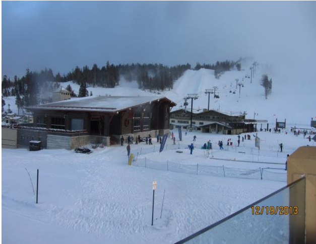
Mammoth Mountain Resort (chair 1) above pic

ACCOMMODATIONS: Staying at Juniper Springs Resort. Inside parking. check-in is at 4PM